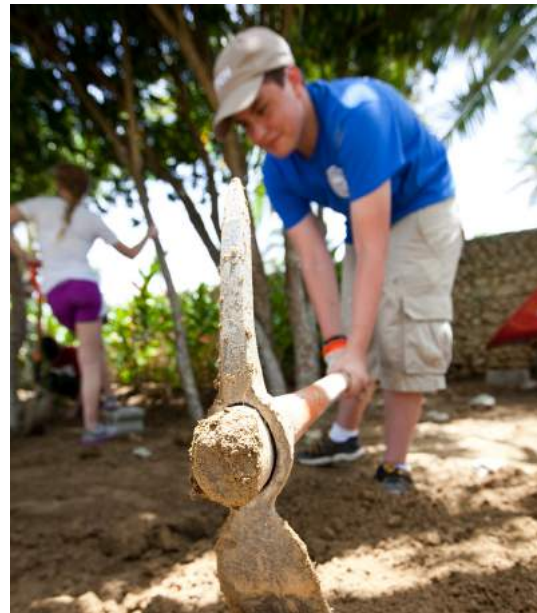
Learn how pineapples are grown and harvested at a local plantation near Santo Domingo.

Collaborate and learn with scientists, engineers, researchers, and other STEM practitioners in the field.